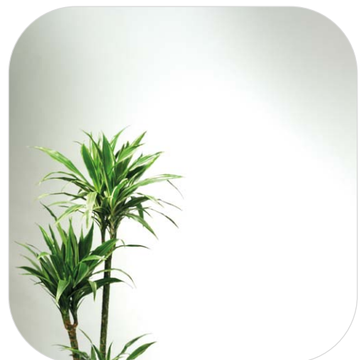
Pilkington Optimirror™ OW